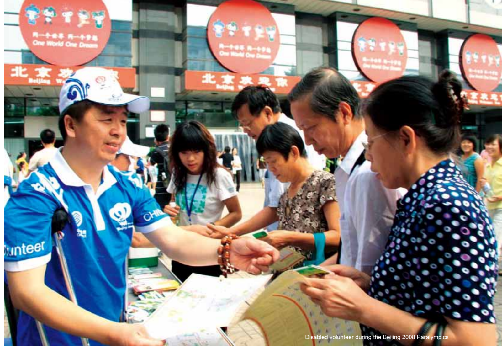
Disabled volunteer during the Beijing 2008 Paralympics

There is now a new trend where the public understand volunteer service and participate more widely in it. Community volunteer organizations supported by MOCA and the youth volunteer organizations of the CYL while mobilizing participation from above have also helped accelerate the openness of society to volunteering, so as to attract people from all walks of life to take part. Beijing Volunteers Association increased its group membership from dozens to over three hundred after it was reformed as the Beijing Volunteer Federation. These groups included a large number of semi-official and non-governmental volunteer organizations. Meanwhile, bottom-up volunteer organizations have steadily grown, at the same time as increases in public recognition of the value of volunteerism and the increasingly spontaneous formation of volunteer organizations. The Government not only now accepts non-governmental volunteer organizations, but also explores ways to provide support and aid. Hangzhou Public Youth Self-organization Service Center was established with the