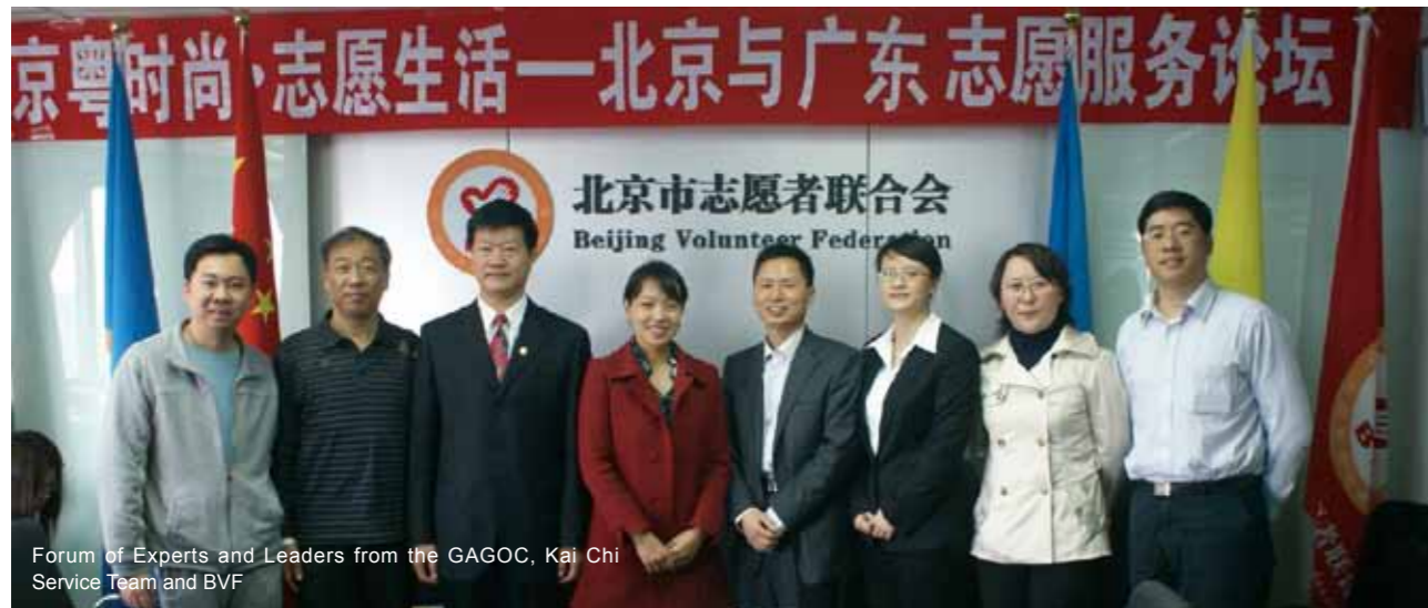
Forum of Experts and Leaders from the GAGOC, Kai Chi Service Team and BVF