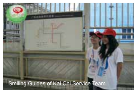
Smiling Guides of Kai Chi Service Team

The economic impact of volunteering has been one of the most significant understated factors. According to a study of volunteering in Australia, Peter Mayer argues that the contribution of voluntary work to GDP growth is seriously underestimated. 20 One estimate of the direct economic benefit of the voluntary work during the Beijing Olympics was 200 million hours of work saving 4.275 billion CNY in wages. 21 So far, no systematic assessment of volunteering in China and its contribution to GDP growth has been made. GDP is simply a measure of productivity, and things without a market value are not picked up. 22 Based on the model used in other countries, volunteering's contribution is likely to be in the order of 1 to 2% of GDP growth. But its contribution to building social capital and social cohesion is universally accepted, even though it has proved very difficult to encapsulate this in economic growth models.