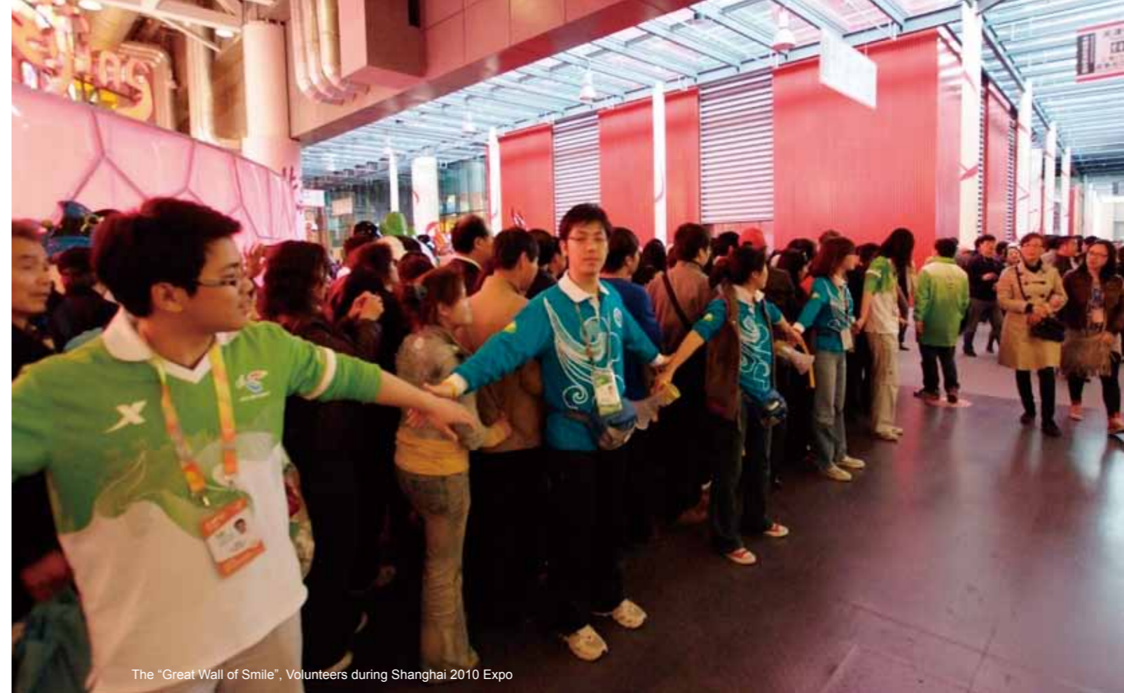
The "Great Wall of Smile", Volunteers during Shanghai 2010 Expo

This report considers the standing of volunteering before the implementation of the next major national budget plan, the 12th Five Year Plan, brought in from 2011. It recommends that volunteerism should play a key role in the delivery of China's development goals over the coming decade – rebalancing the economy, addressing inequality and maintaining sustainable growth. It proposes a number of simple administrative measures can be taken to build on the clear successes of the last decade, and to optimize the role of volunteering even further in China's future development. It recommends diversification and innovation of volunteering opportunities adapted from the traditional models used to now, and a stronger role for grassroots groups, with clearer government support through regulation and budgetary assistance being given to them. Volunteering is now a recognised and valued part of Chinese civic life. There is every reason to believe that the next decade will see it expand and develop even further.