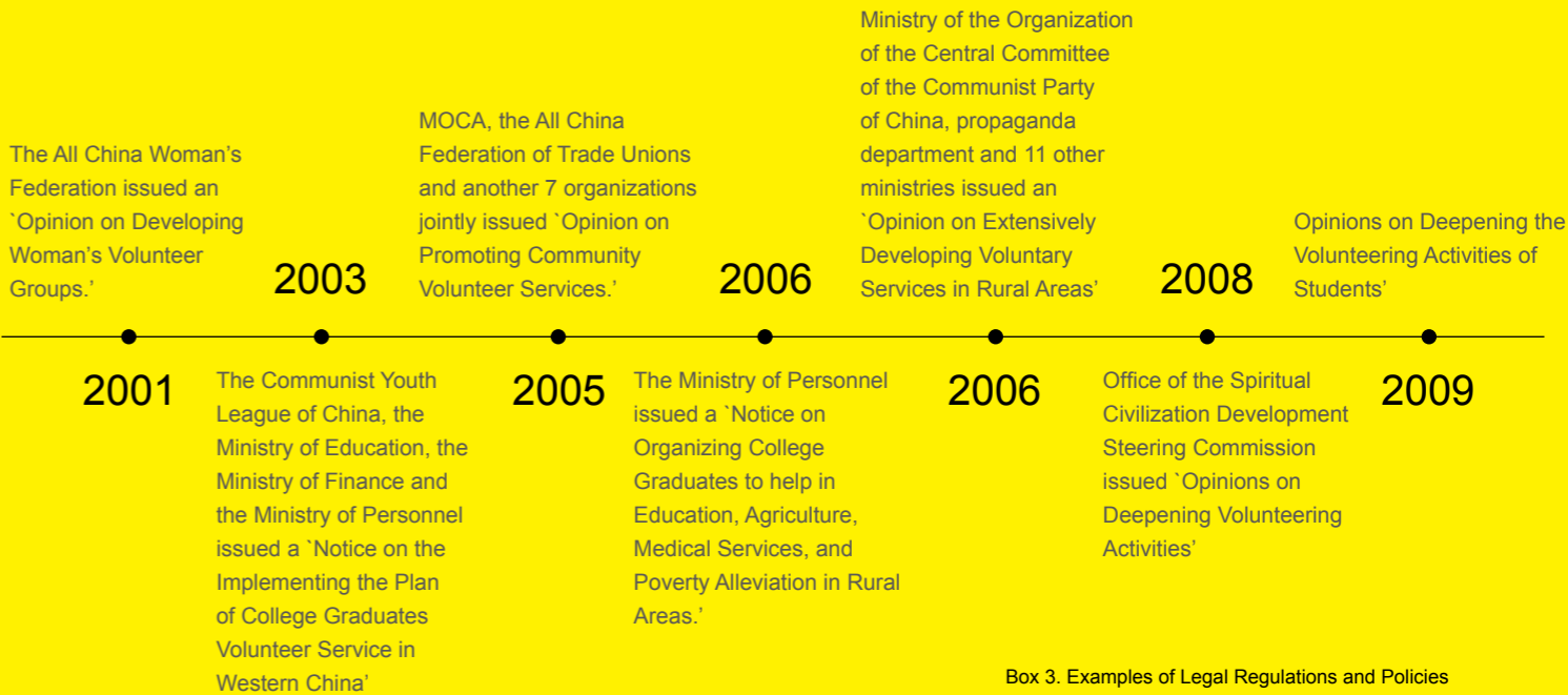
Box 3. Examples of Legal Regulations and Policies

In 2008, the Spiritual Civilization Steering Committee of the Chinese Communist Party (CCP) issued an administrative policy on volunteers. This can be seen as the definitive national policy on volunteering so far. Liu Yunshan, a member of the Political Bureau of the CCP Central Committee, also issued a clear a directive on how to develop volunteerism and coordinate the complex group of stakeholders. On his initiative, the China Volunteer Service Foundation was founded in 2009. In the same year in 2009, the drafting process for a national volunteer legislation began and the bill was submitted to the NPC in 2010.