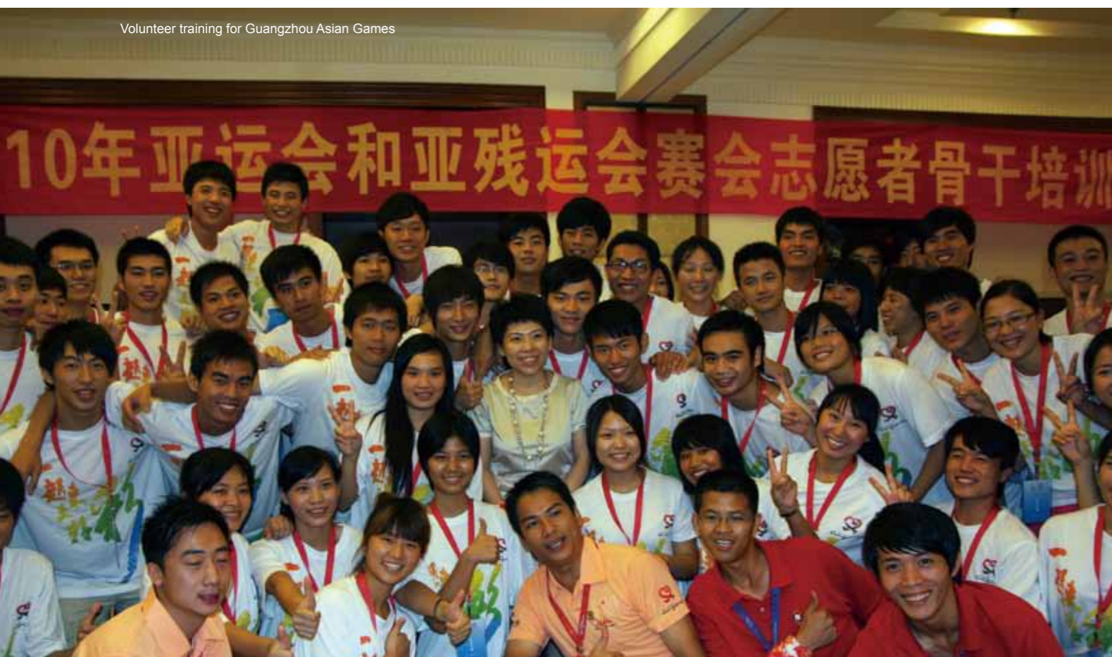
Volunteer training for Guangzhou Asian Games