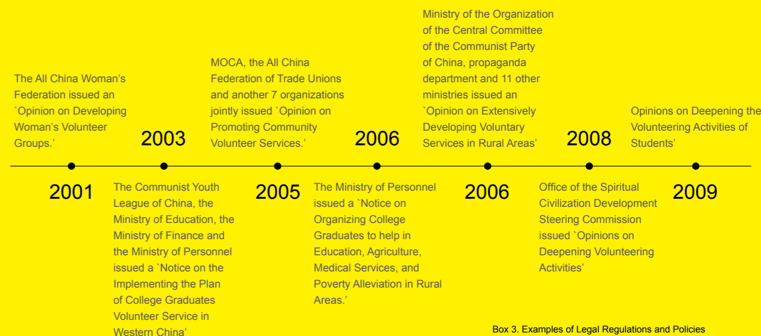
Box 3. Examples of Legal Regulations and Policies

In 2008, the Spiritual Civilization Steering Committee of the Chinese Communist Party (CCP) issued an administrative policy on volunteers. This can be seen as the definitive national policy on volunteering so far. Liu Yunshan, a member of the Political Bureau of the CCP Central Committee, also issued a clear a directive on how to develop volunteerism and coordinate the complex group of stakeholders. On his initiative, the China Volunteer Service Foundation was founded in 2009. In the same year in 2009, the drafting process for a national volunteer legislation began and the bill was submitted to the NPC in 2010.