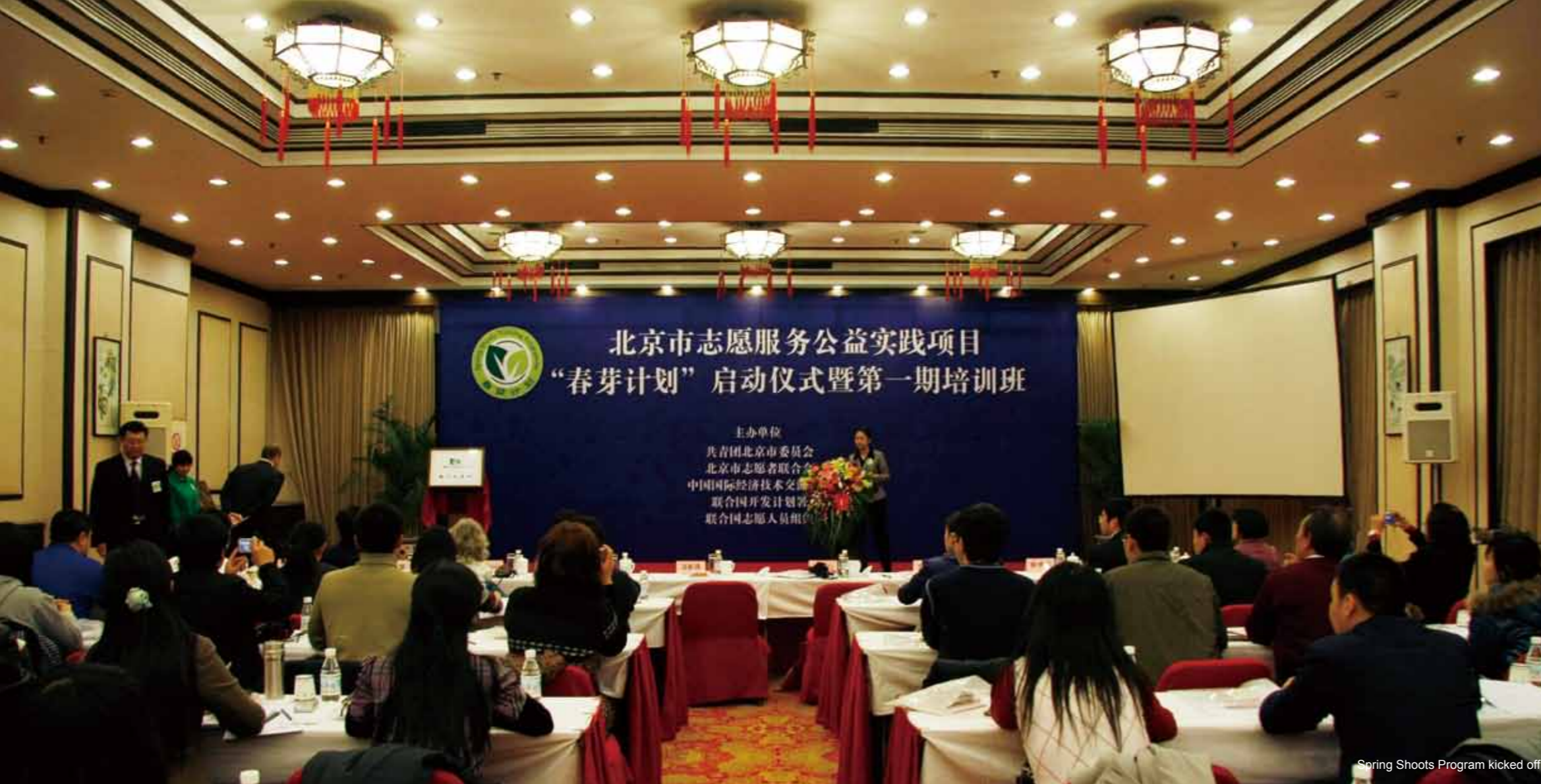
Spring Shoots Program kicked off

in 2009 by BVF with the purpose to improve volunteer management capacity in Beijing. The programme offers volunteer project management training classes targeted at community based volunteer managers and core volunteers, both from the sub-district level of the BVF/BYL system and from grassroots organizations. In addition, a team of 19 BVF in-house trainers was formed through a professional Training of Trainers (ToT) course focused on international standard project management and a series of trainer skills workshops. The new trainers will in turn deliver training for local volunteer leaders in the 16 Beijing Districts. Some have already conducted sessions on the essentials of volunteer project management for approximately 100 trainees in Dongcheng and Chaoyang Districts. They will continue to provide training under the newly established “Shining Steps Training Programme”, an enlarged, updated version of the “Spring Shoots Training Programme”.