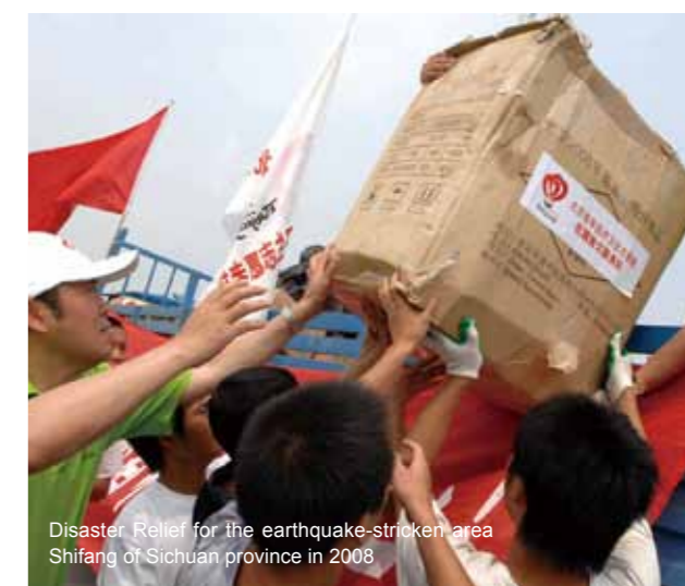
Disaster Relief for the earthquake-stricken area Shifang of Sichuan province in 2008

In recognition of the role of volunteering, the Sichuan Provincial People's Congress passed the 'Sichuan Volunteer Services Ordinance' in September 2009 which outlined a legal framework for the registration of volunteers and organizational rights, obligations and legal responsibilities.