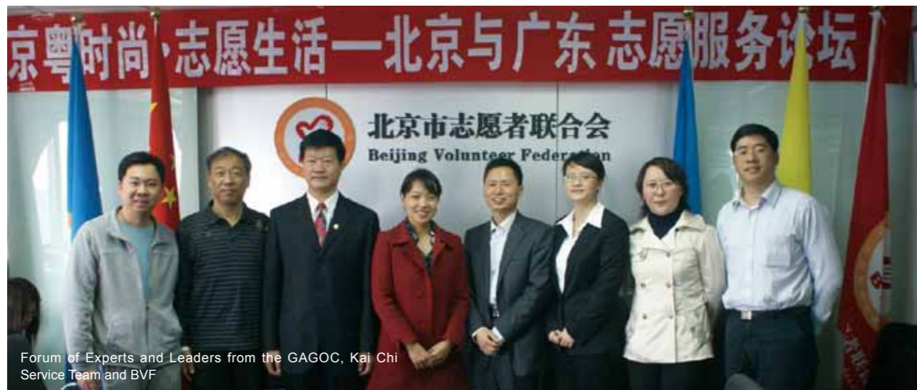
Forum of Experts and Leaders from the GAGOC, Kai Chi Service Team and BVF