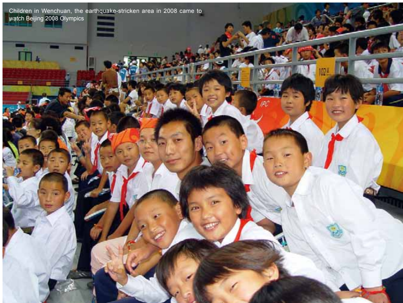
Children in Wenchuan, the earthquake-stricken area in 2008 came to watch Beijing 2008 Olympics