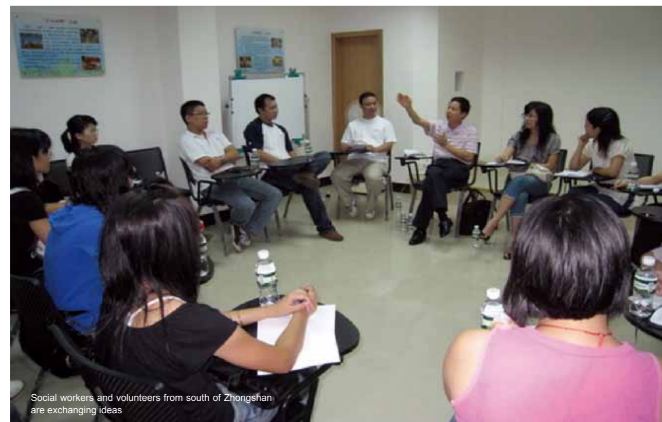
Social workers and volunteers from south of Zhongshan are exchanging ideas

in China", "Study of Beijing Olympic Games voluntary service", "Study of Beijing voluntary service model", "Study of voluntary service system", has reference value for the whole country. In recent years, the Research institutions such as Civil Society Studies Center of Peking University, China Humanistic Olympic Studies Center of Renmin University, the Information Center of the China Youth Volunteers Association, the Working Committee on Volunteers at CASW, Beijing Voluntary Service Development Study Center, Beijing Volunteer Research Association, Voluntary Research Center in Beijing Normal University, Voluntary Research Institute of Guangdong Youth College, Voluntary Service and Social Policy Research Center in Zhongshan University and other special research organizations have emerged, thus deepening the development of volunteerism through deeper knowledge of its impact on society, giving new frameworks within which to see and understand it.