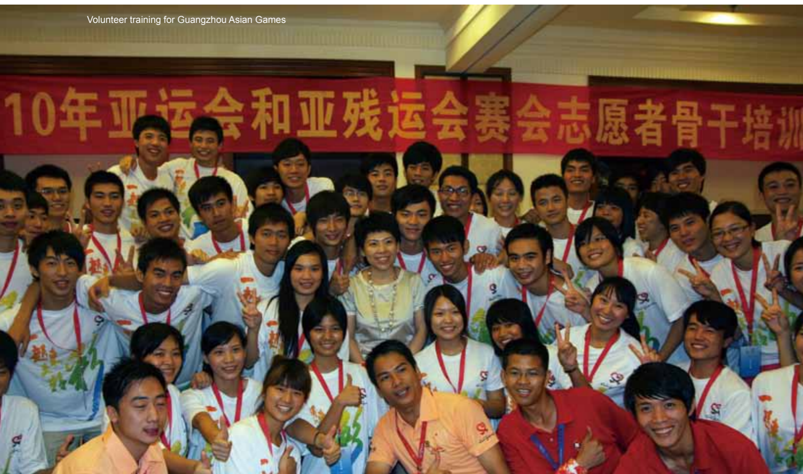
Volunteer training for Guangzhou Asian Games