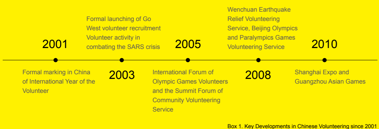
Box 1. Key Developments in Chinese Volunteering since 2001

According to the 1999 UNDP report, 'Volunteerism in China', one of the first volunteer-involving community project was set up in 1989 in the Heping district of Tianjin to provide assistance to the elderly. This project served as a model for a number of other similar community projects in the rest of China. The report explained that volunteerism in Chinese society has its own history and characteristics, and that this was rooted in a key element of social life in China, the centrality of the family and the local community