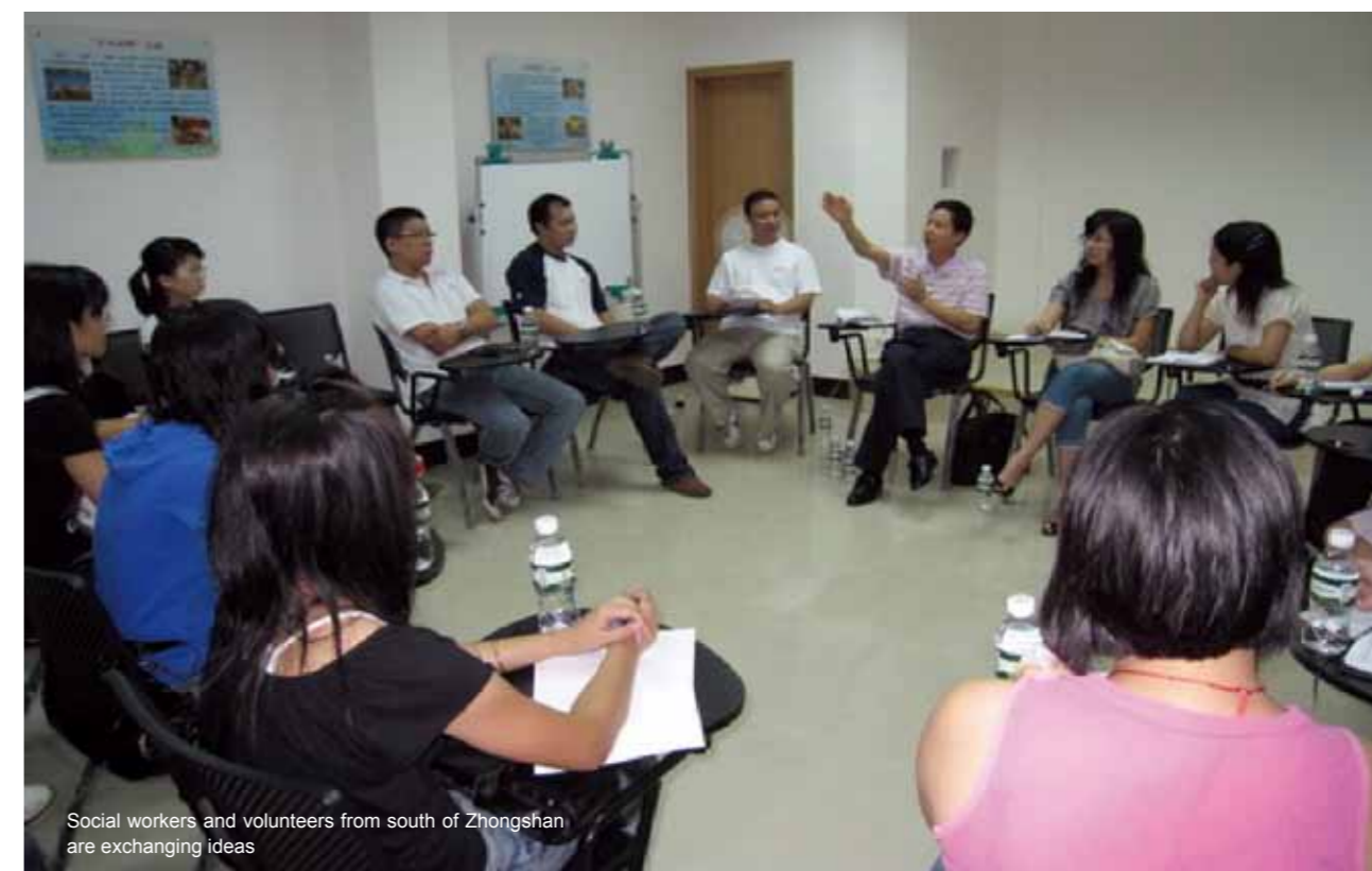
Social workers and volunteers from south of Zhongshan are exchanging ideas

in China", "Study of Beijing Olympic Games voluntary service", "Study of Beijing voluntary service model", "Study of voluntary service system", has reference value for the whole country. In recent years, the Research institutions such as Civil Society Studies Center of Peking University, China Humanistic Olympic Studies Center of Renmin University, the Information Center of the China Youth Volunteers Association, the Working Committee on Volunteers at CASW, Beijing Voluntary Service Development Study Center, Beijing Volunteer Research Association, Voluntary Research Center in Beijing Normal University, Voluntary Research Institute of Guangdong Youth College, Voluntary Service and Social Policy Research Center in Zhongshan University and other special research organizations have emerged, thus deepening the development of volunteerism through deeper knowledge of its impact on society, giving new frameworks within which to see and understand it.