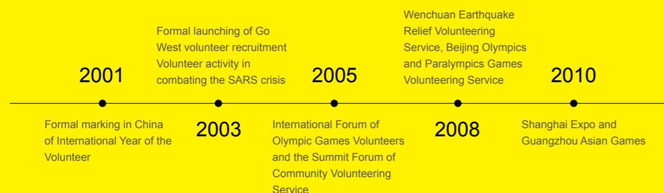
Box 1. Key Developments in Chinese Volunteering since 2001

According to the 1999 UNDP report, 'Volunteerism in China', one of the first volunteer-involving community project was set up in 1989 in the Heping district of Tianjin to provide assistance to the elderly. This project served as a model for a number of other similar community projects in the rest of China. The report explained that volunteerism in Chinese society has its own history and characteristics, and that this was rooted in a key element of social life in China, the centrality of the family and the local community